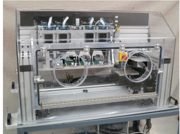
Figure 5: ImTech I-Jet 4100 with glove box. [3]

Multi-head systems enable blending, as well as multiple-material layering. Curing stations add to the functionality. Some applications require an ultra-clean environment, and need features such as glove boxes.