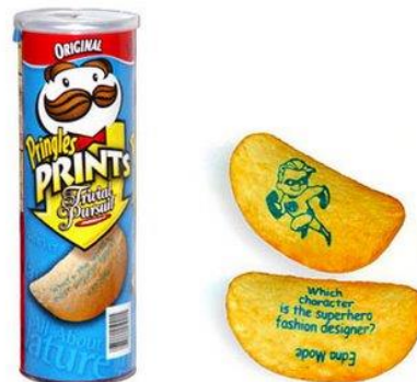
Figure 6: Printed Pringles. [4]

Real-world applications are evolving from specialty applications, such as printing images on cakes, to full-on industrial production featuring digital decoration. And those applications are evolving as well. Pringles utilized ink jet technology to print trivia questions and images on its crisps.