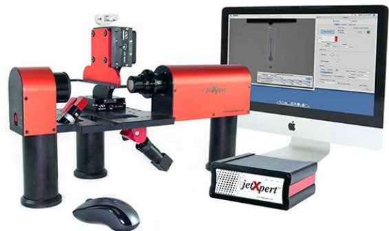
Figure 8: ImageXpert JetXpert drop-in-flight analysis tool [6]

By pairing a high speed strobe light with a zooming camera and synchronizing them with the printhead firing, a dropwatcher is able to capture clear images of single drops in flight. Software then analyzes the images, and provides data to ascertain how well the fluid performs. Issues with drop formation, variations in drop size, and a host of other parameters can then be tweaked until the jettable material is refined to perform as desired.