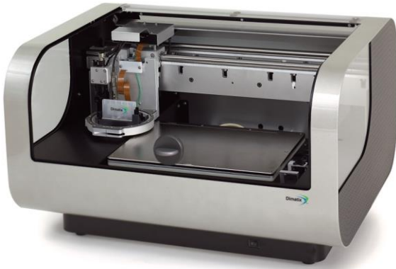
Figure 3: Dimatix materials printer DMP-2831. [2]

Developmental systems typically feature a single printhead. These systems provide a method for developing jettable materials and prototyping.