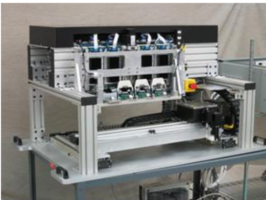
Figure 4: ImTech four printhead I-Jet 4100. [3]

These systems can utilize multiple fluids and materials, allowing the build-up and mixing of unique fluids. With extremely precise process repeatability, jetting accuracy, and a broad range of materials compatibility, multi-head systems serve as excellent tools for product development, and can also be scaled up for small-scale manufacturing, and beyond. Applications such as optical device manufacturing and biologic dosing are being achieved utilizing ink jet technology.