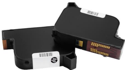
Figure 1: HP thermal ink jet printhead. [1]

There are a number of ink jet technologies in the marketplace. For example, thermal ink jet provides a low-cost ink jet technology. However, because thermal ink jet heats the fluid rapidly (and to a very high temperature) to expel materials, it is limited in the fluids and materials it can jet.