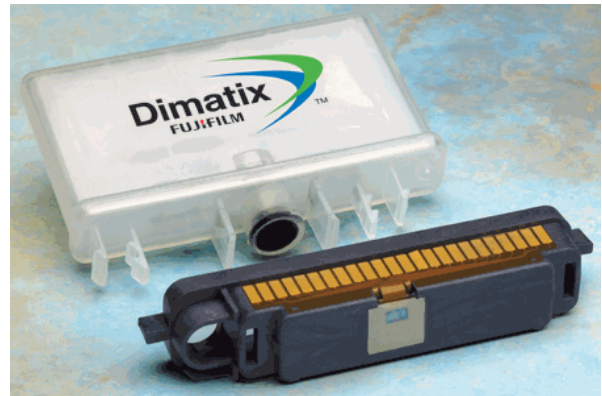
Figure 2: Dimatix piezo-driven jetting device.[2]

Piezoelectric printheads fire the material when a voltage is applied to the piezo element. The material chamber can be heated, to aid in the jettability, but it is not a prerequisite for firing the material. Piezo-based ink jet printheads offer precise performance, ideal for countless opportunities of research, development, and manufacturing applications.