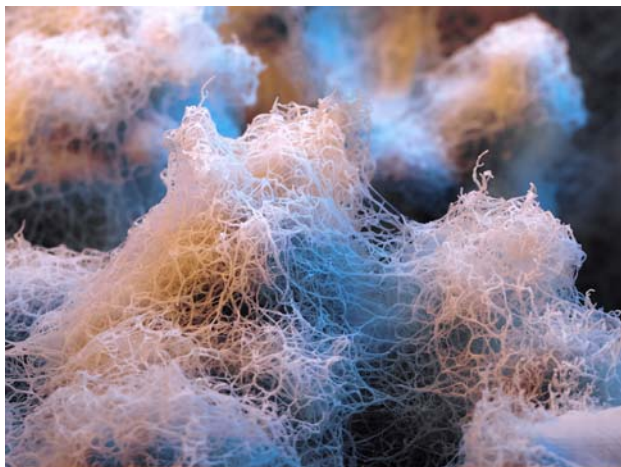
Fig. 3: Nanoporous polymer foams for thermal insulation of buildings have a big potential for energy savings.

With a view to reducing the energy losses in power transmission, it is hoped that the unusually high electrical conductivity of nanomaterials like carbon nanotubes can be used for power cables. There are also nanotechnological approaches to the optimisation of superconducting materials for loss-free transmission. In the long term, options also exist for power transport without cables, using lasers, microwaves or electromagnetic resonance, for example. For power distribution in the future, power networks will be needed which offer dynamic load and fault management, a demand led power supply with flexible price mechanisms and the possibility of power input from a large number of decentralised, renewable power sources. Nanotechnologies could make significant contributions to the realisation of this vision, for example through nano-sensoric and power electronics components capable of handling the extremely complex control and monitoring of such power networks.