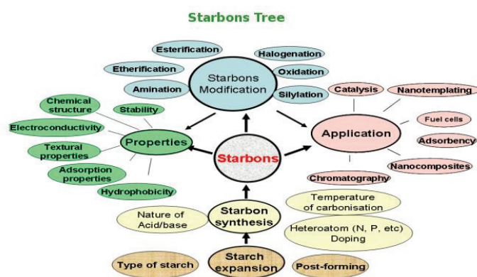
Figure 2: Starbon Tree of properties and applications

Alginic acid-derived Starbon® pyrolysed to 800 °C were analysed by in-situ TEM which showed the development of turbostratic graphite from 550 °C, a catalysed process attributed to calcium nanoparticles present in the structure. Commercial PGC separation of five carbohydrates (mannitol, sucrose, maltitol, raffinose and stachyose) was compared against a Starbon® column and the Starbons® materials proved to be comparable with the elution order, although the Starbon® column also appears to partially separate the carbohydrates raffinose and stachyose, better than the commercial material.