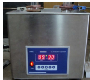
Fig.1 Photograph of Ultrasonic bath

Al 2 O 3 /DMAC nanofluids of required volume concentrations of 0.1% to 1.5% were prepared by dispering specified amount of Al 2 O 3 nanoparticles in to Dimethylacetamide using an Ultrasonic bath which generates ultrasonic pulses at a frequency of 25kHz. To get a uniform dispersion of the particles in the base fluid, the mixture was sonicates for one hour(Fig.1). Fig. 2 shows the prepared nanofluids.