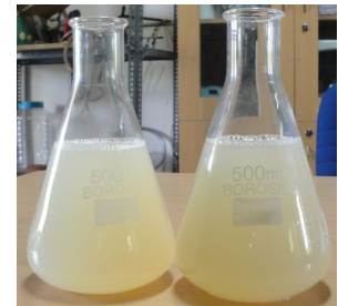
Fig.2 Photograph of prepared nanofluids