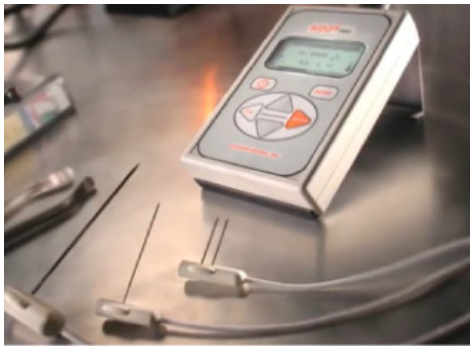
Fig. 3 Photograph of KD2 Pro thermal property analyser

where q is constant heat rate applied to an infinitely long and small line source, \Delta T_1 and \Delta T_2 are the temperature changes at times t_1 and t_2 respectively. The calibration of the sensor needle was carried out first by measuring the thermal conductivity of distilled water, glycerine and ethylene glycol. The measured values for distilled water, glycerine and ethylene glycol were 0.611, 0.292 and 0.263 W/mK respectively which are in agreement with the literature values of 0.613, 0.285 and 0.252 W/mK respectively, within \pm 5\% accuracy. 50 ml nanofluid samples were taken in a test tube of 3 cm diameter whose mouth is closed using a septum through which the sensor needle was inserted. For accurate measurements, the needle was inserted fully into the fluid and was oriented vertically inside the test tube without touching its side walls.