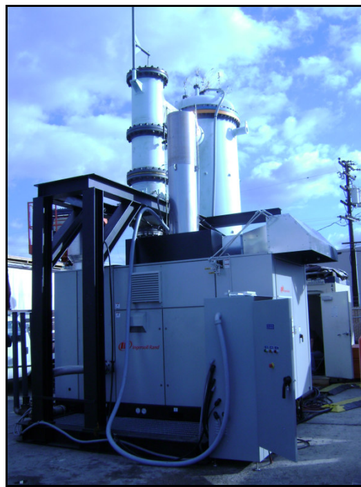
Figure 3: 250kW Flex Powerstation

The first commercial 250kW Flex Powerstation was shipped to Fort Benning, Georgia, in March 2011 as part of a landfill gas to energy project funded by the Department of Defense. FlexEnergy expects this unit to be up and running by late May 2011. The landfill gas is 28% methane by volume, a gas that until now could only be flared. This site