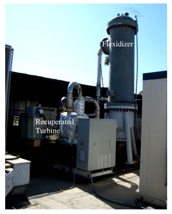
Flex Under Development Test Figure 2

The Flex offers energy recovery where it was previously impossible. It is designed to adapt to environments where fuels vary in content and strengths. The Flex tolerates moisture and other contaminants in the gas, eliminating the problems typically associated with the use of alternative methane fuels as an energy source. No other technology offers a solution for this large untapped market.