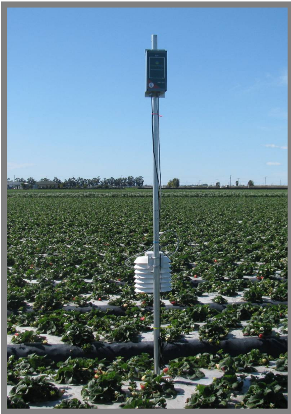
Figure 5: ClimateMinder Wireless Sensor Node in a Strawberry Field