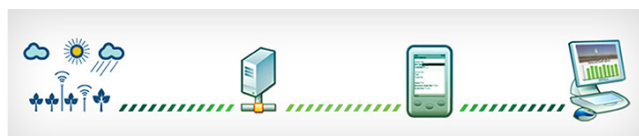
Figure 1: ClimateMinder Top Level Architecture

Users receive text messages or email alerts on their cell phone and/or use the Web site or GrowMobile cell phone application to browse measurements and control alert and control conditions. The ClimateMinder product has three parts: GrowFlex, GrowMobile and ClimateMinder Server.