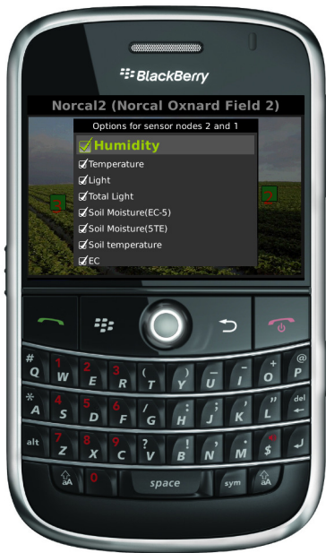
Figure 3: GrowMobile™ Screenshot on a Handset

GrowMobile™ is a mobile application that provides remote access to, and control of, the system from mobile handset. GrowMobile is the application that growers use for remote access to, and control of, ClimateMinder from wherever they are, with their mobile handset.